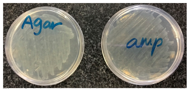
Figure 3. Colony polymerase chain reaction products. Lane 1: 100 bpDNA size marker; Lane 2-5: Ia gene (446 bp)