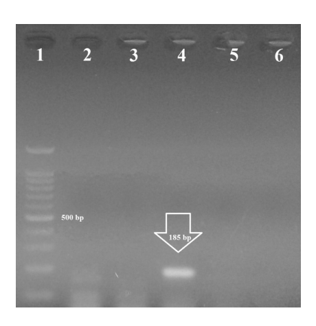
Figure 1. Electrophoresis of polymerase chain reaction products on 1.5% agarose gel stained with safe stain; lane 1) 100 bp molecular weight marker, lanes 2, 3, 5) negative samples, lane 4) Mycoplasma gallisepticum -specific 185 bp band, lane 6) negative control.

According to the results, none of the 19 (0.0%) broiler flocks were positive for M. Gallisepticum . However, regarding the layer-breeder flocks, one isolate (i.e., 25% of 4 layer-breeder flocks, 1% of 100 tracheal swabs from these flocks, and 0.34% of 290 swab samples) was M. gallisepticum -positive in PCR assay and produced the predicted 185 bp amplification product (Table 1, Figure 1).