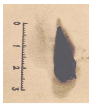
Figure 1. Melanoides tuberculata snail from Khouzestan province of southwestern Iran

From the total of 1540 M.tuberculata (Figure 1), which were examined in this research, 46 (2.9 %) snails were infected with various species of larva trematodes.